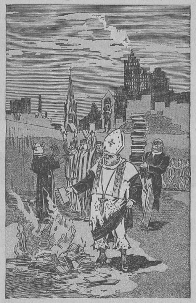
PRISON KEEPERS ADVISE BOOK-BURNING Page 43