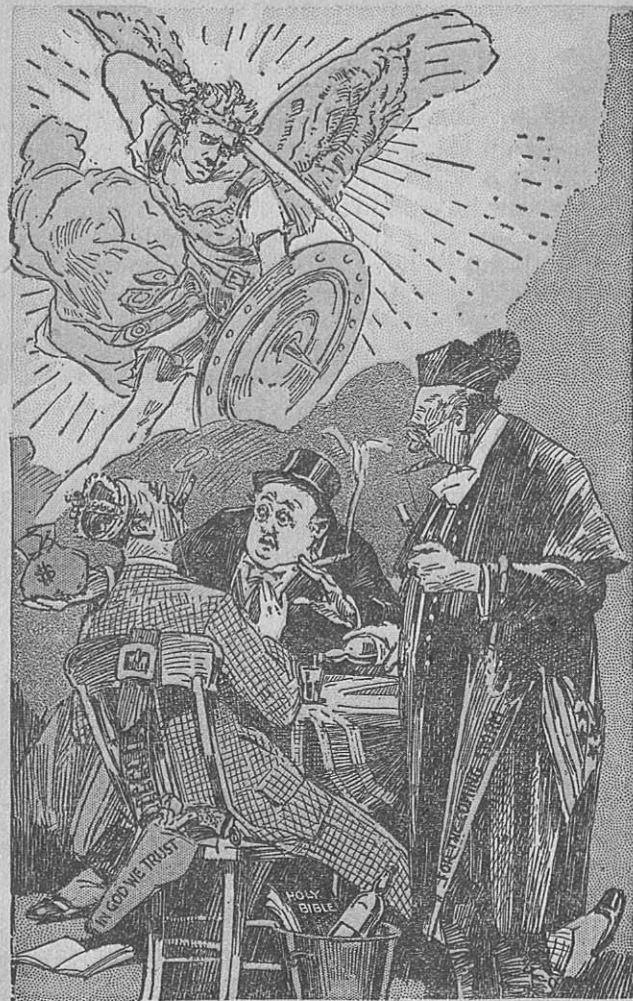
"In the days of these kings shall the God of heaven set up a kingdom."—Daniel 2: 44

Let the people now take courage in the fact that no unrighteous government shall be permitted much longer to oppress mankind. God made the earth for man to inhabit in peace and happiness, and this He will bring about. Before righteousness and unselfishness can entirely prevail on earth, however, it is absolutely necessary that all nations of unrighteousness or self-