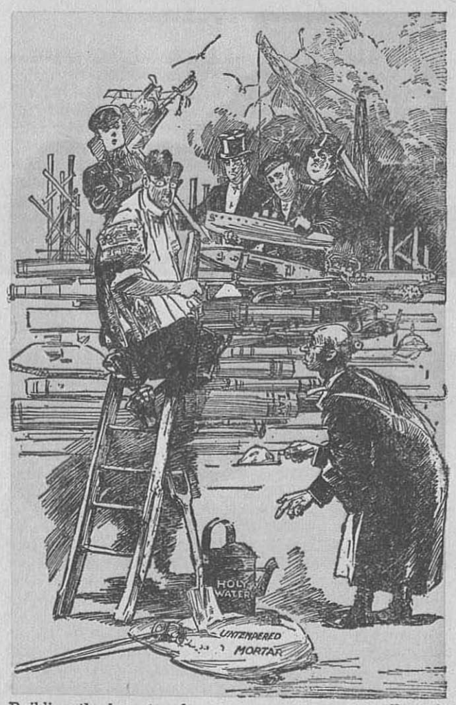
Building the breastworks