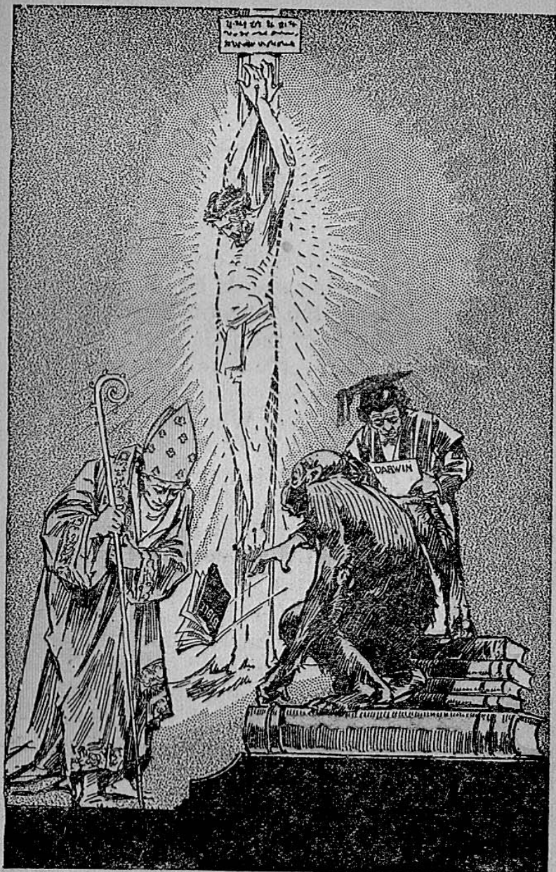
Evolution or Christ?

exactly corresponded to the perfect man Adam when he was in Eden. He was qualified, therefore, to redeem the human race. "Ransom" means an exact corresponding price, and the perfect man Jesus exactly corresponded to the perfect Adam and could become the ransom.