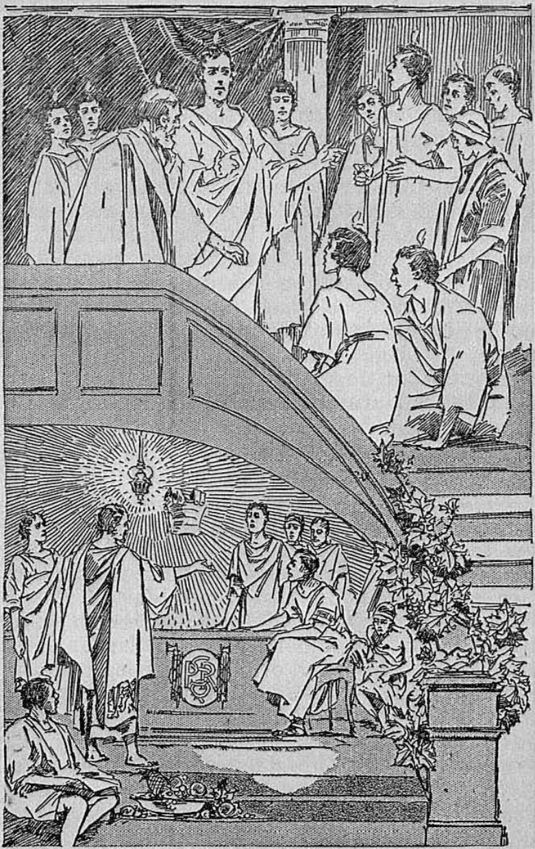
Peter uses the first key A.D. 33 Peter uses the second key A.D. 36