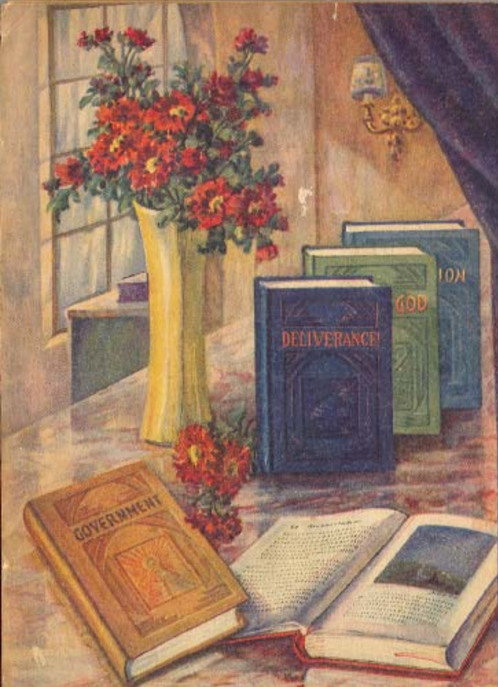
JUDGE RUTHERFORD'S FIVE REMARKABLE BOOKS (See Page 63)

JUDGMENT OF THE JUDGES OF THE PREACHERS OF THE NATIONS OF THE POLITICIANS OF THE FINANCIERS OF SATAN'S ORGANIZATION OF THE PEOPLES