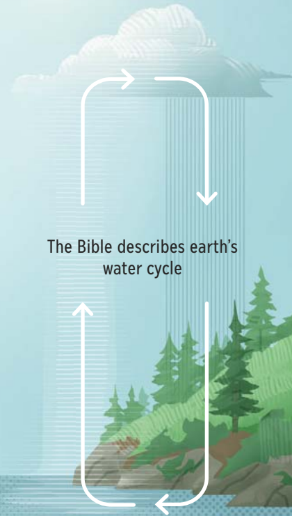
The Bible describes earth's water cycle