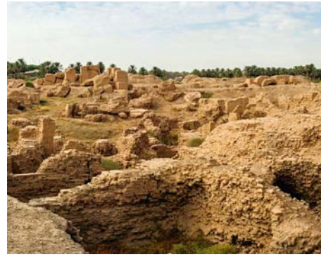
Babylon’s ruins in modern-day Iraq

* B.C.E. means “Before the Common Era,” and C.E. means “Common Era.”