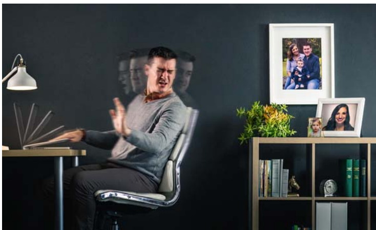
How can we show Jehovah that we hate immorality?

Satan does not want us to enter God’s new world. But Jehovah’s principles can protect us from any satanic trap.