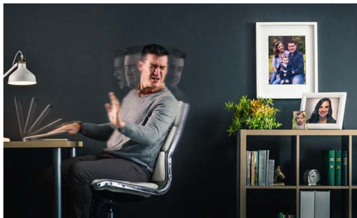
How can we show Jehovah that we hate immorality?

Satan does not want us to enter God’s new world. But Jehovah’s principles can protect us from any satanic trap.