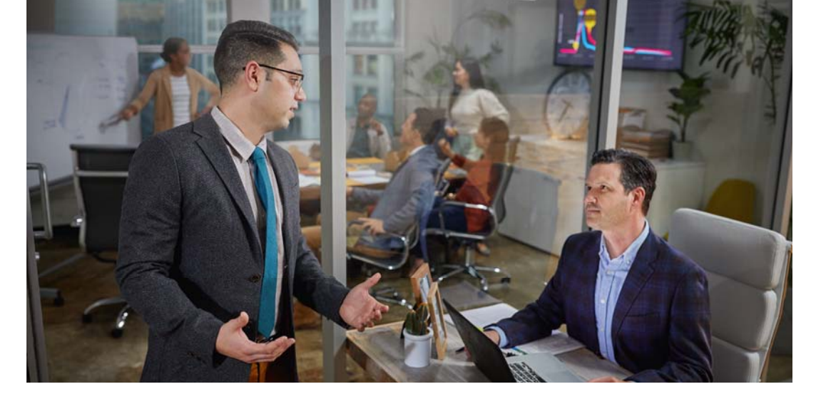
Do our decisions show that we trust in Jehovah's promise to care for our material needs? (See paragraph 16)

remarkable wisdom Jehovah has shown by giving us the resurrection hope! By means of it, he disarms Satan of one of his most effective weapons and at the same time arms us with unbreakable courage.