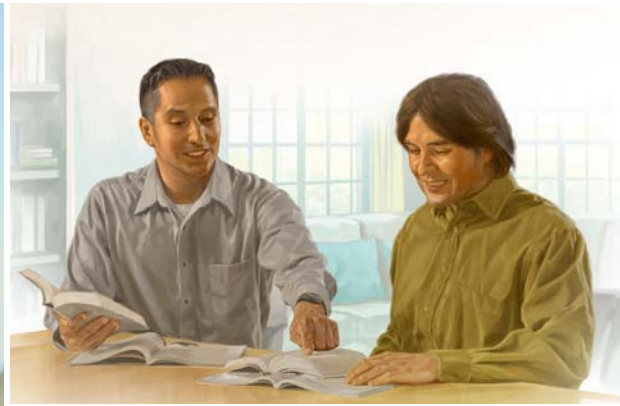
Those who survive Armageddon will teach resurrected ones about God's Kingdom and about Jehovah's requirements (See paragraph 6)