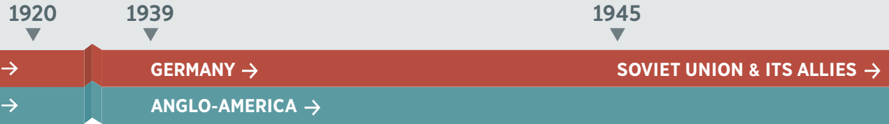
CHART NOT TO SCALE