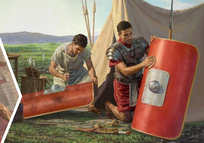
After a battle, soldiers made sure that their shields were repaired (See paragraph 3)

contact with apostates. We do not allow anyone or anything, including curiosity, to draw us into arguing with them.