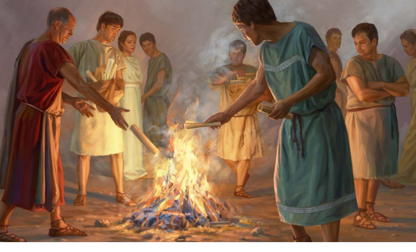
Imitate the early Christians by getting rid of anything you may have that is connected with the occult and by rejecting spiritistic entertainment (See paragraphs 10-12)