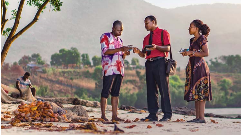
Our ministry helps us stay focused (See paragraph 12)

21:34) Rather, they make obeying Jesus' commands a priority in life, even in the face of challenging circumstances. Many of our brothers are enduring severe trials, including attacks by opposers, extreme poverty, and natural disasters. Through it all, they remain faithful to Jehovah, cost what it may. To them, Jesus gives the following assurance: "Whoever has my commandments and observes them is the one who loves me. In turn, whoever loves me will be loved by my Father."—John 14:21.