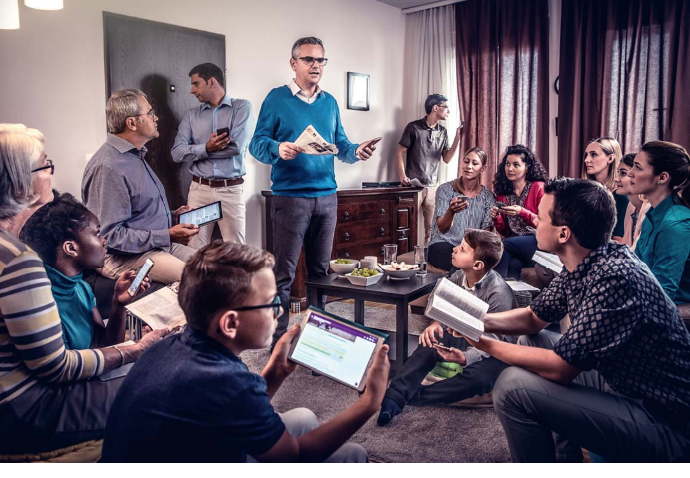
Jehovah will glorify his name and deliver his people (See paragraph 16)

of printed and online material, videos, and audio publications!