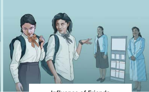
Influence of Friends