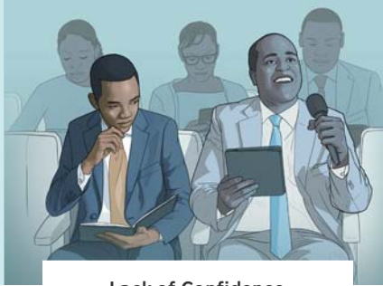
Lack of Confidence