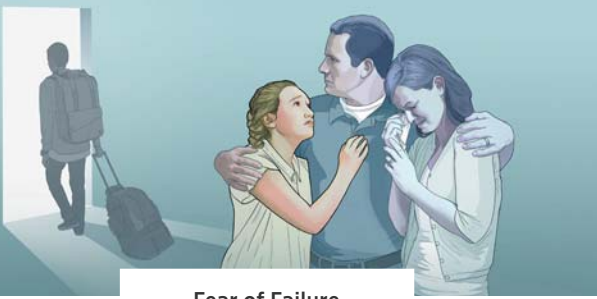
Fear of Failure