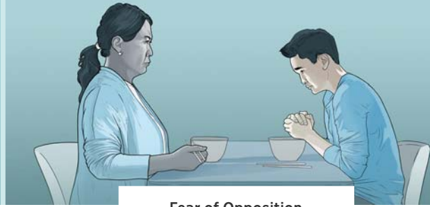
Fear of Opposition