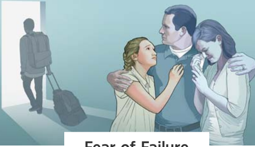
Fear of Failure