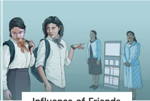
Influence of Friends

How you can overcome these challenges (See paragraphs 9-16)