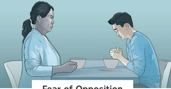
Fear of Opposition