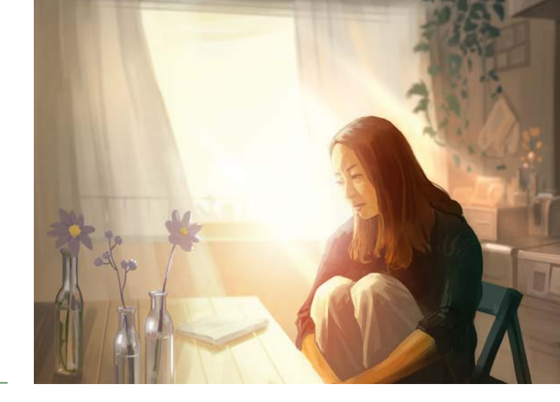
Jehovah loves us and knows when we suffer injustice (See paragraph 15)

22:13-19) When the elders were fair and the Israelites obeyed the Law, everyone benefited, and the nation brought honor to Jehovah.—Lev. 20:7, 8; Isa. 48: 17, 18.