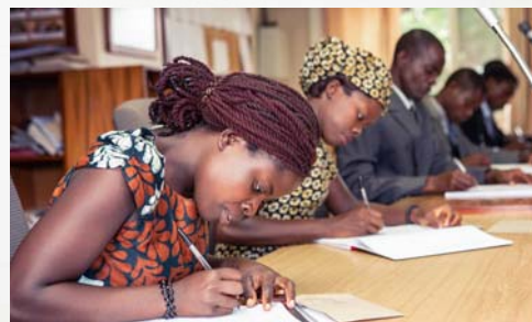
Top left: witnessing tour across Australia, 1937; top right: Gilead graduate arriving at her assignment in Mexico, 1947; bottom left: preaching in Brazil; bottom right: attending the School for Kingdom Evangelizers in Malawi