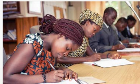
Top left: witnessing tour across Australia, 1937; top right: Gilead graduate arriving at her assignment in Mexico, 1947; bottom left: preaching in Brazil; bottom right: attending the School for Kingdom Evangelizers in Malawi