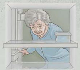
Low finances (See paragraph 17)