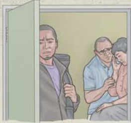
Wayward children (See paragraph 16)