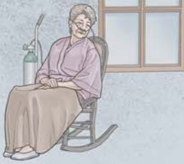
Health problems (See paragraph 15)