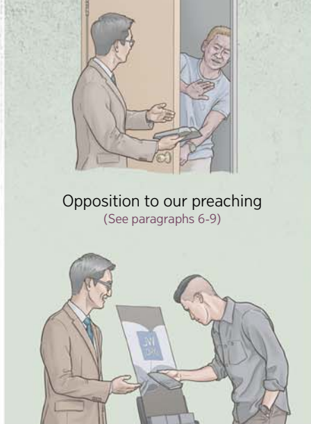
Opposition to our preaching (See paragraphs 6-9)

When dealing with problems, “trust in Jehovah and do what is good”