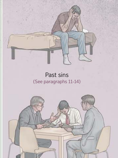
Past sins (See paragraphs 11-14)