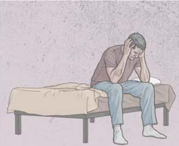
Past sins (See paragraphs 11-14)