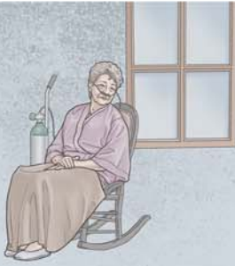
Health problems (See paragraph 15)