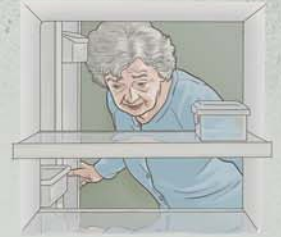
Low finances (See paragraph 17)