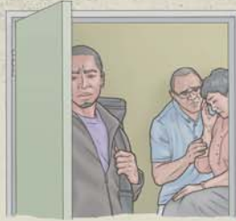
Wayward children (See paragraph 16)