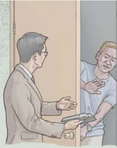
Opposition to our preaching (See paragraphs 6-9)

When dealing with problems, “trust in Jehovah and do what is good”