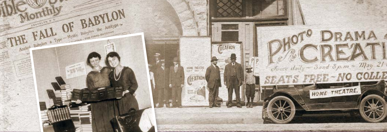
Those Bible Students were zealous! (See paragraphs 6, 7)

6 In actual fact, the Bible Students who were on hand during World War I (1914-1918) gave a tremendous witness during that time. It was not easy for them to do so, for several reasons. We will consider two of them. First of all, the main work being done in those days involved the distribution of Bible literature. When the book The Finished Mystery was banned by the secular authorities in early 1918, preaching became difficult for many of the brothers. They had not yet learned to preach using the Bible alone, and they had been counting on The Finished Mystery to “do the talking” for them. A second factor involved the devastating outbreak of the Spanish Influenza in 1918. The pervasiveness of that dreadful plague made it difficult for publishers to move about freely. In spite of these and other challenges, however, the Bible Students as a whole did their best to keep the work going.