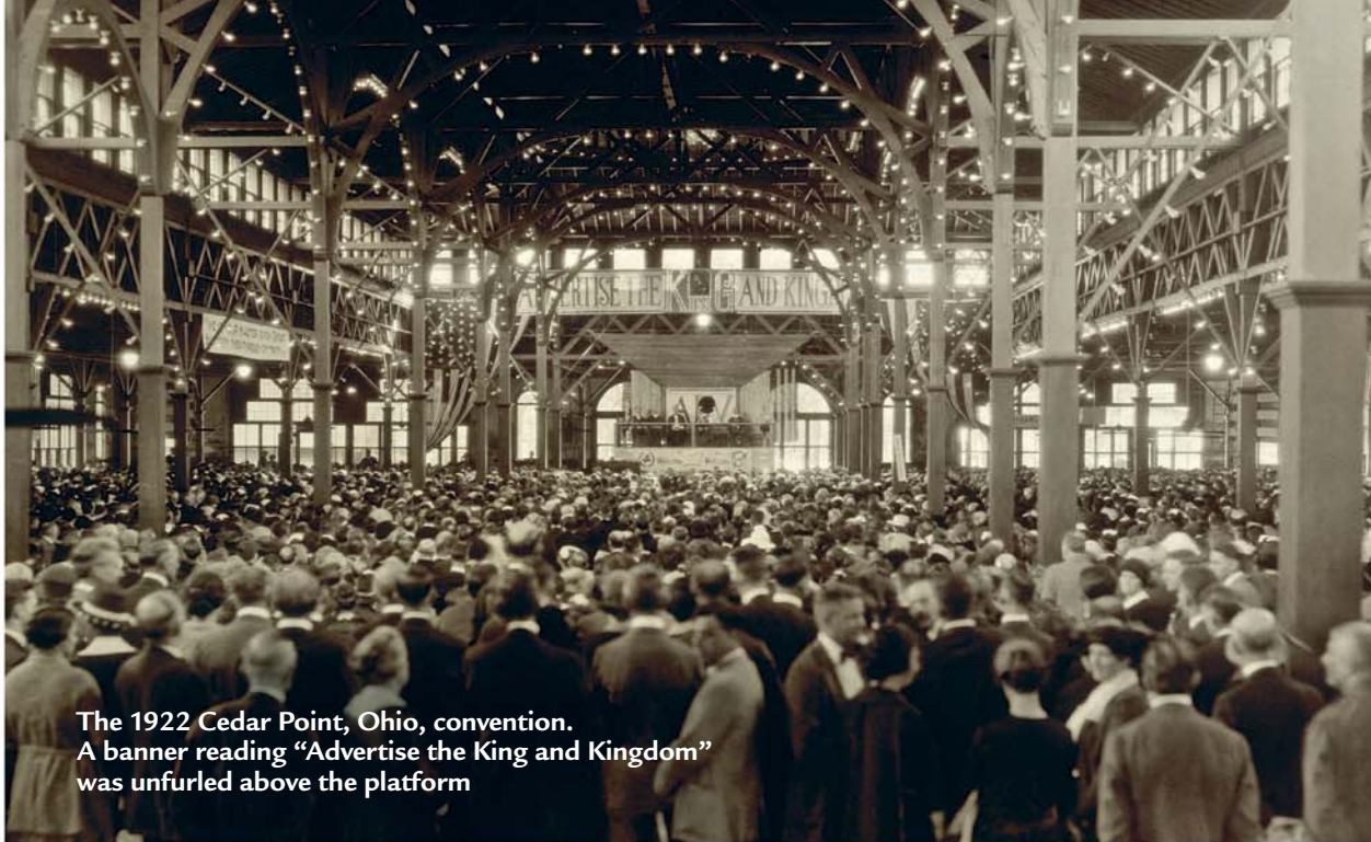
The 1922 Cedar Point, Ohio, convention. A banner reading “Advertise the King and Kingdom” was unfurled above the platform