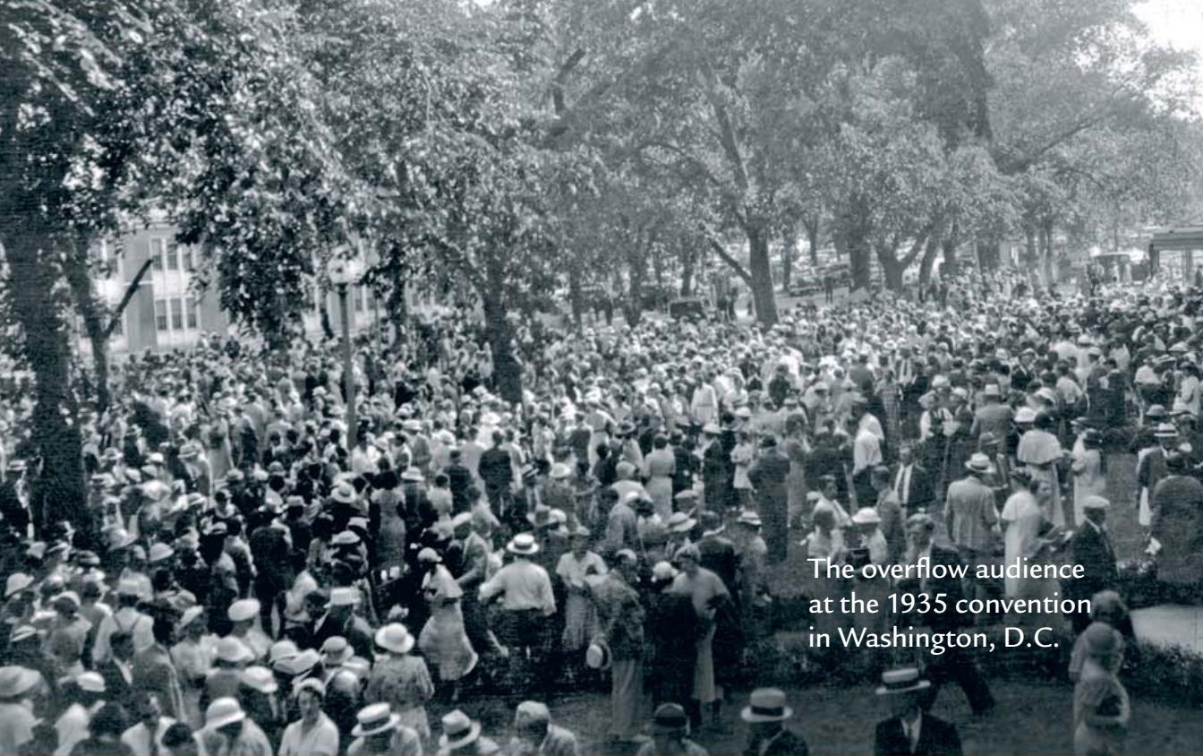
The overflow audience at the 1935 convention in Washington, D.C.