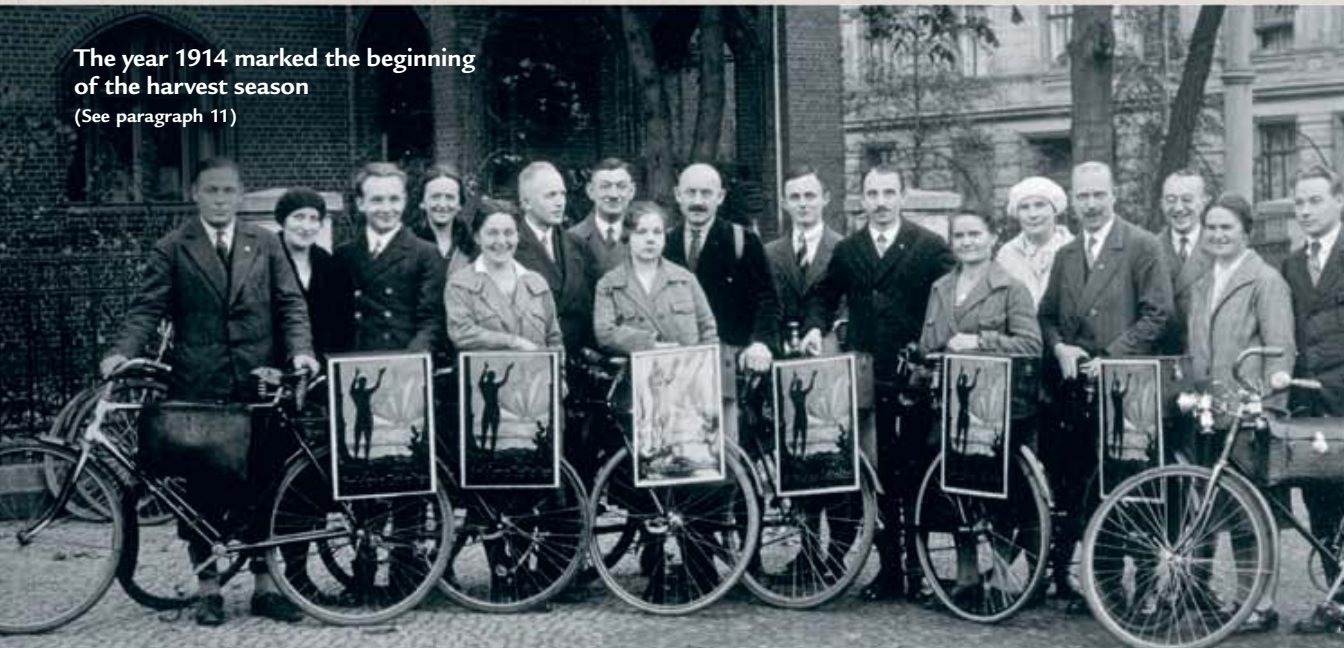
The year 1914 marked the beginning of the harvest season (See paragraph 11)