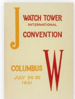
Convention program, 1931

15. (a) By the 1930’s, what had our brothers acquired? (b) What time had come?