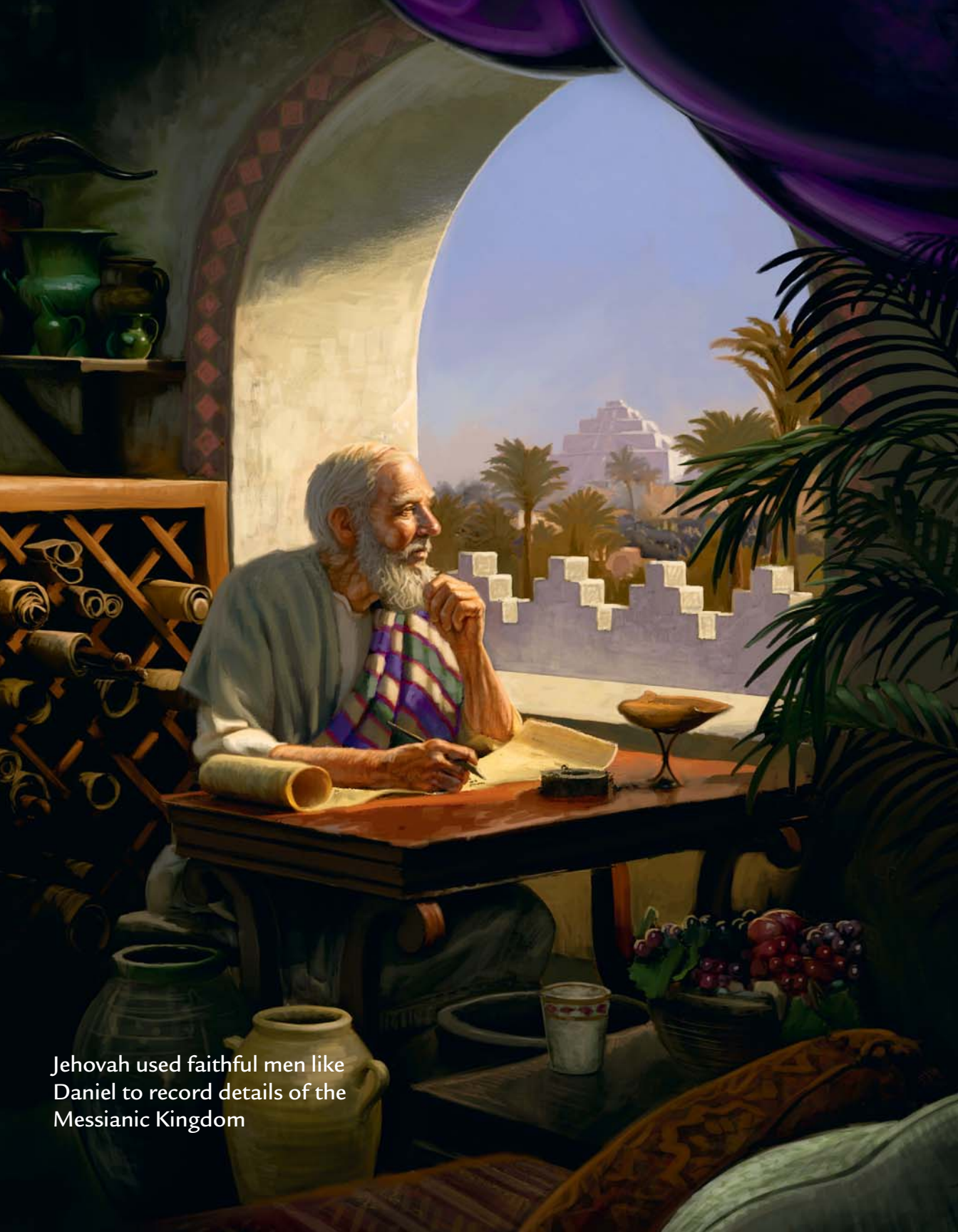
Jehovah used faithful men like Daniel to record details of the Messianic Kingdom