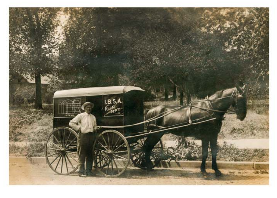
A colporteur. Note the "Chart of the Ages" painted on the side of the carriage