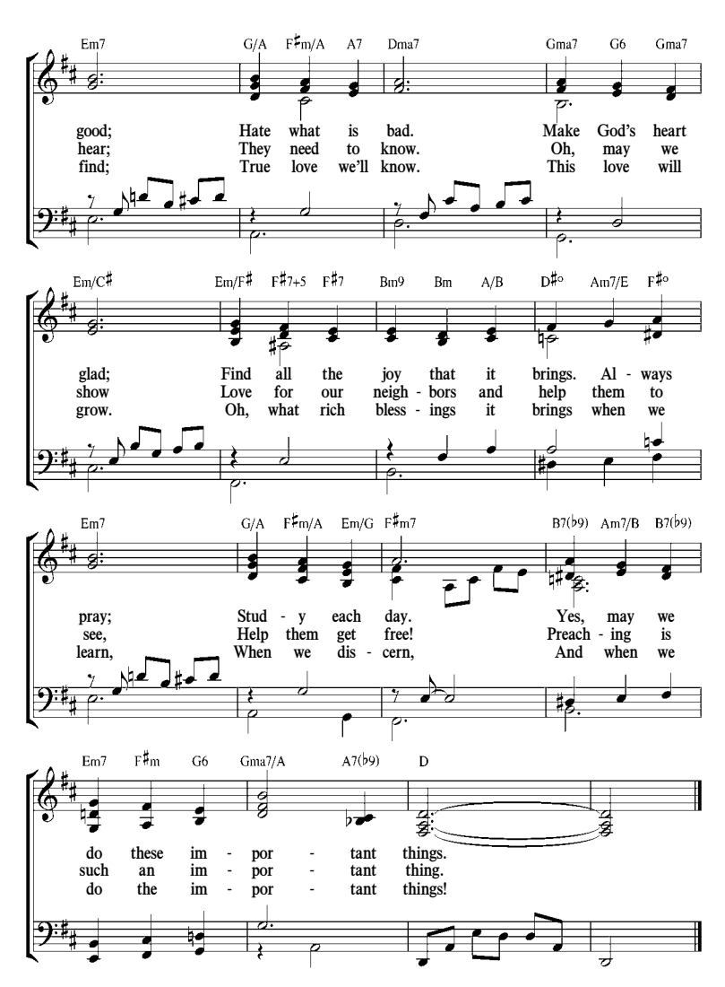
(See also Ps. 97:10; Matt. 22:37; John 21:15-17; Acts 10:42.)