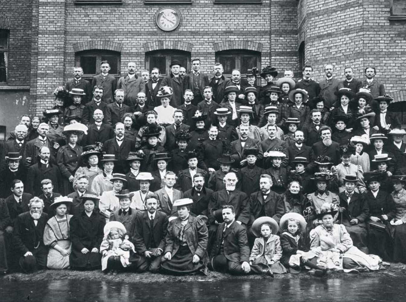
Charles Russell with a group of early Bible Students in Copenhagen, Denmark, in 1909