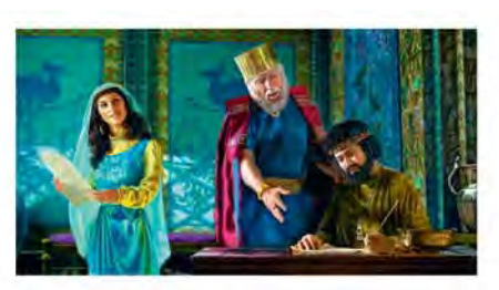
Mordecai and Esther "divide spoil" —Gen. 49:27 w12 1/1 p. 29