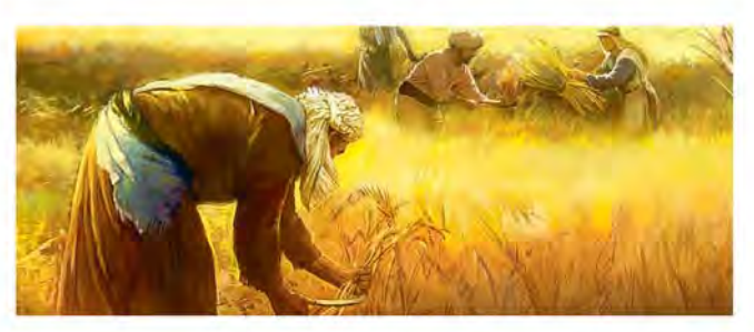
Illustration of the wheat and the weeds—Matt. 13:24-30 w13 7/15 pp. 13-14

Jesus comes, arrives —Matt. chaps. 24 and 25 w13 7/15 pp. 7-8, 24