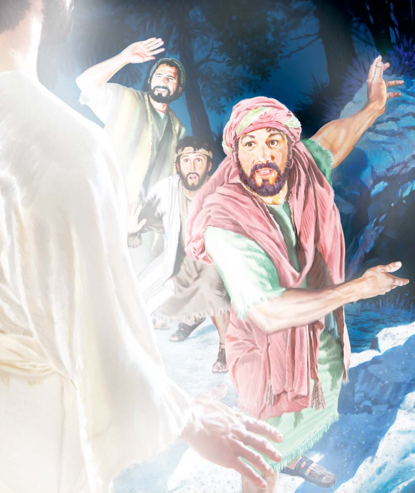
Along with James and John, Peter was rewarded with a thrilling vision