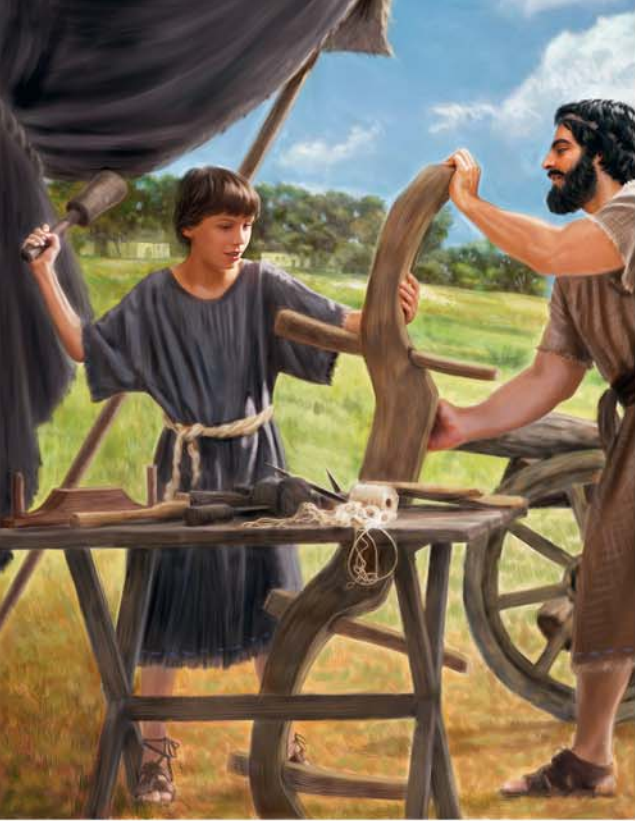
Joseph trained his son to become a carpenter

brought his family back to their homeland. An ancient prophecy had foretold that Jehovah would call his Son “out of Egypt.” (Matt. 2:15) Joseph helped to fulfill that prophecy, but where would he lead his family now?