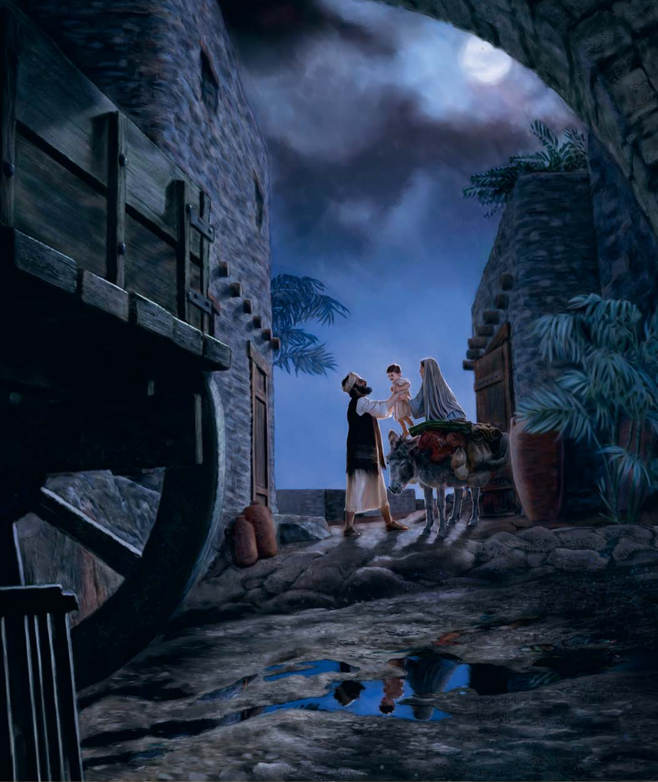
Joseph acted decisively and selflessly to protect his child