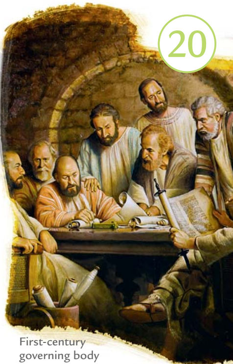
First-century governing body