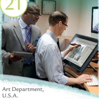
Art Department, U.S.A.