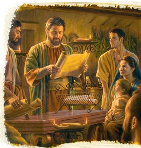
Reading the governing body’s letter