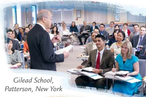
Gilead School, Patterson, New York

It is a way to walk in Jesus’ footsteps. Jesus was sent by God from heaven to the earth to live among sinful humans. Although he saw injustices here, Jesus did not try to reform society. He concentrated on his mission to “declare the good news of the kingdom of God” —the only solution to mankind’s problems. (Luke 4:43) Genuine Christian missionaries follow his example.