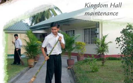
Kingdom Hall maintenance