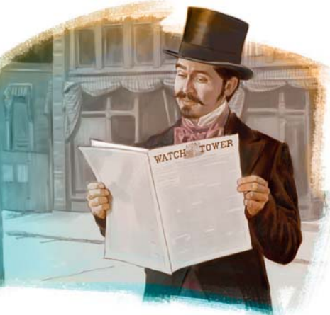
First issue of The Watchtower , 1879