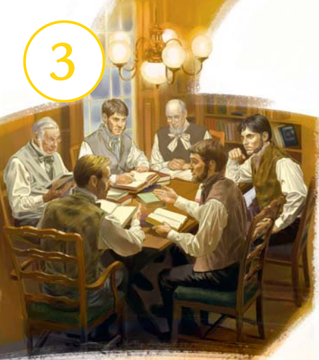
Bible Students, 1870's