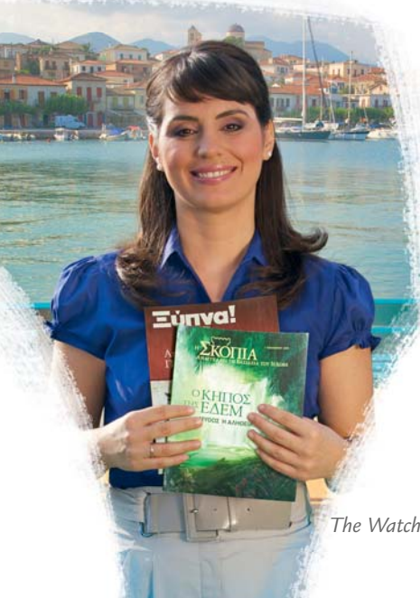
The Watchtower today