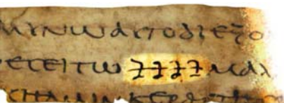
Symmachus fragment containing the divine name at Psalm 69:31, third or fourth century C.E.