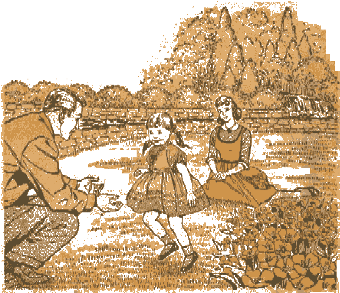
Children will be brought forth in righteousness

51 However, marriage will not be the only procedure contributing toward the filling of the earth 51. What other grand provision has the universal king made for filling our earth, and in what way has he reassured man that it will happen?