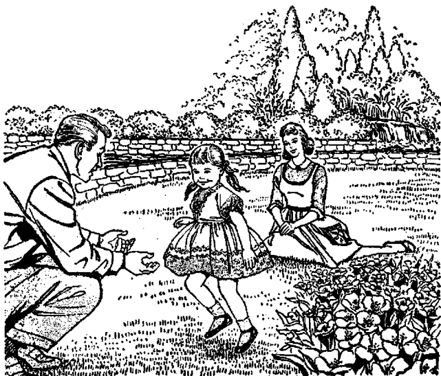
Children will be brought forth in righteousness

51. What other grand provision has the universal king made for filling our earth, and in what way has he reassured man that it will happen?