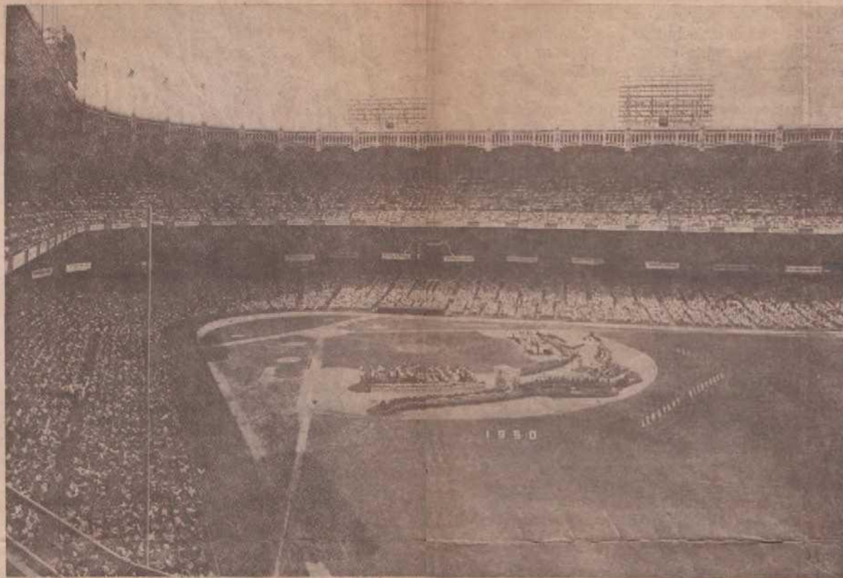
View of Yankee Stadium filled to capacity on opening day of the 1950 assembly. Seventy thousand from 67 nations here observe the graduation of students from 32 nations, who had just finished their missionary studies at the Watchtower Bible School of Gilead. The opening day of the 1953 assembly, Sunday, July 19, you can attend Gilead's 21st graduation.

This assembly is not just to sing hymns and have prayer meetings. It will be profitable and instructive, practical and informative. Discourses on each day's program will increase your knowledge of God's Word, will help you understand the reason for the troubles and confusion in the earth today, and will give practical information that can be applied to your daily living. Here you will learn of the fulfillment of Bible prophecies concerning the coming of a New World society, a new system of things that will replace today's tired, worn-out and discouraging old world. You will see the results of such a system in the unity, oneness and Christian fellowship evident at the assembly. Today we face the worst of times. Ahead, however, are the best of times. Do you know why? Do you want to benefit from them? Would you like to know why Jehovah's witnesses do not have the world's cringing fear of the future, but instead demonstrate vigorous Christian action all over the globe? The answer is in no sense political, but concerns what God's Word says about our day. Come hear this answer, and be convinced!