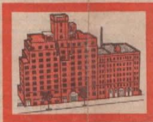
The world headquarters of the Watchtower Society, located at 124 Columbia Heights in Brooklyn. The studios of radio station WBBR are located here.

Watchtower radio, WBBR, 1330 on your dial, will broadcast some sessions of the assembly. This noncommercial station's programs are always outstanding, and from time to time during the next few weeks it will provide interesting information about this unusual gathering. WBBR broadcasts daily from 6 till 8 a.m., Sunday until eleven, and every day except Monday and Saturday from 5 to 8 p.m. On your dial at 1330 you will find thought-provoking programs. Listen to WBBR and heed its invitation to assemble at Yankee Stadium, July 19 through 26.