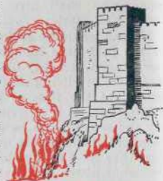
VALLEY OF HINNOM (GEHENNA)

Human courts of justice impose the death penalty, not torture, for the worst of crimes. God's justice is no less than man's. He is no fiend or sadist. He too decrees the death penalty, not torture, for the incorrigibly wicked, "everlasting cutting-off" from life, with no possibility of a resurrection. (Matthew 25:46) A fitting symbol, therefore, of such eternal destruction was the garbage dump in the