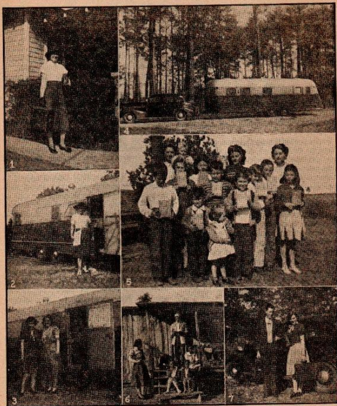
Witnessing in Dixie Land