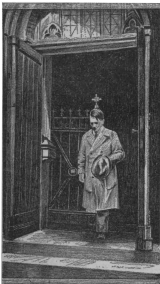
From a photograph of Hitler coming out of a Catholic church.—In London Catholic Herald .

At any rate, during his entire tour of occupied France he showed a surprising interest in religious edifices and monuments. He visited Notre Dame and the Madeleine in Paris, the cathedrals at Amiens, Chartres, and Strasbourg. On returning to Berchtesgaden, he ordered the building of a chapel at the Berg-