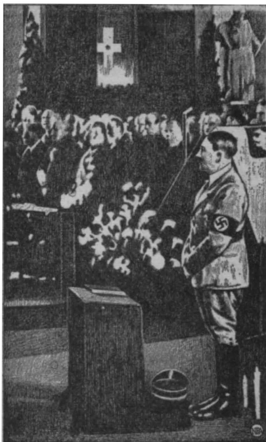
Hitler in St. Hedwig's Cathedral, Berlin

It may be that some do not believe that Hitler is a Catholic. This is not surprising, in view of the barrage of propaganda concerning Hitler's supposed persecution of the Catholic church. Many deny that Hitler is a Catholic. All this is propaganda to sidetrack the people and offset the pope's consistent refusal to ex-communicate his star performer. The following written testimony, confirmed by photographic evidence, should sweep aside any false ideas on the point. (See accompanying pictures of Hitler in the Catholic church, and leaving the church after the service.) In the book Mein Kampf , written by Adolf Hitler,—though it is claimed a Catholic priest had a hand in its preparation, and certainly its pages are