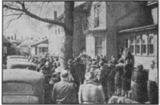
400 gathered outside this Rochester, N. Y., home to hear appropriate messages from The Theocracy, on the occasion of a funeral. See the loud-speaker at upstairs window.

At Rochester, N. Y., recently, those present at a funeral heard words of real comfort, conveyed to them by transcription. Several hundred persons outside the home likewise heard the message of the resurrection, a loud-speaker installed outside enabling them to hear.