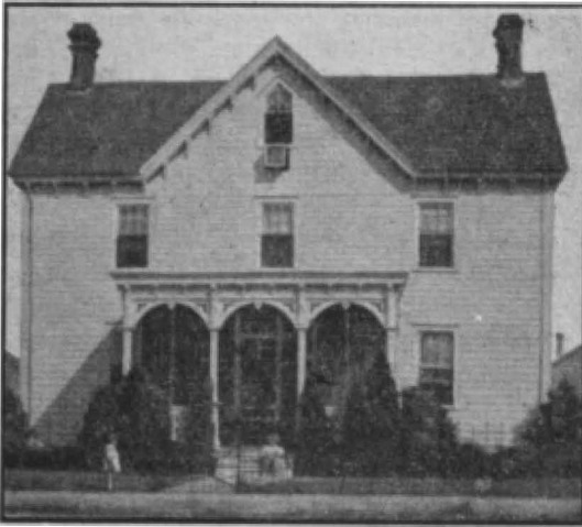
Advertising The Theocracy by means of a loud-speaker, third-floor window, Chincoteague Island, Virginia

I T IS part of the commission of Jehovah's witnesses, as ordained ministers of The Theocracy, “to comfort all that mourn.” (Isaiah 61:1-3; Matthew 5:4) It is therefore appropriate that they should be ready to extend that comfort when asked to do so on the occasion of a funeral. It is a comfort to know that one's dead are not in “purgatory” or the orthodox “hell”. It is a comfort to