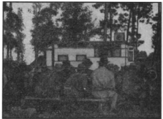
Transcription meeting in Berrien county, Georgia. See loud-speaker on roof of car.

The mourning ones are not limited, however, to those who have lost some relative or friend in death. Many lives are darkened as a result of grief from other causes. Transcription recordings setting forth the consolation that will be realized in the Theocratic kingdom of Jehovah God are sounded forth by Jehovah's witnesses.