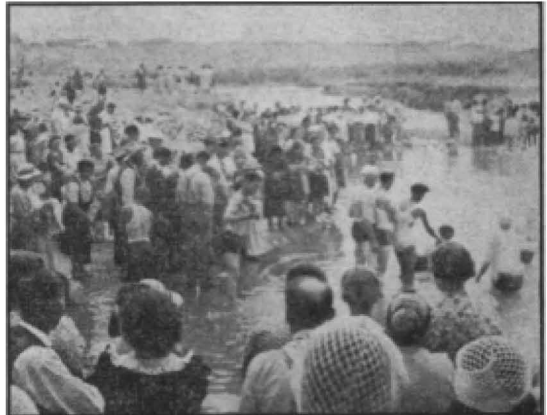
Baptism in the Rio Grande at El Paso Assembly