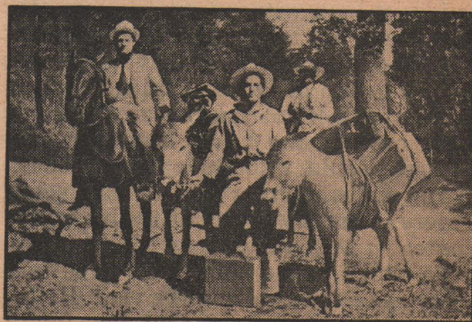
Horses and donkeys carry books and phonographs in rural Mexico.

The Devil had another shock in a small way locally, just before 1940 faded out.