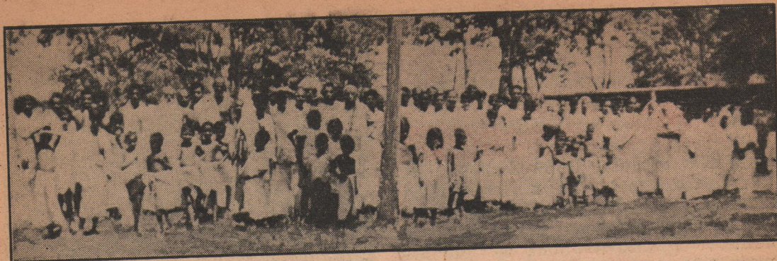
Thottucaud, Travancore, India, company of Jehovah's Kingdom publishers

me to attend the convention sponsored by the Thottucaud company of Jehovah's witnesses to give a public address on "Religion as a World Remedy" and talk to the witnesses on some of the latest Watchtower articles. I accepted gladly, and that is how it began.