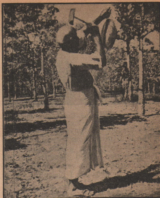
Summoning the conventioners at Thottucaud

found myself quite out of sympathy with their idea of music, although undoubtedly it was sweet in the ears of Him for whom it was intended. Each line was sung twice, first by two chosen singers and then by everybody else, and the first two singers took a deep breath for that next top note. And it was mostly top notes!