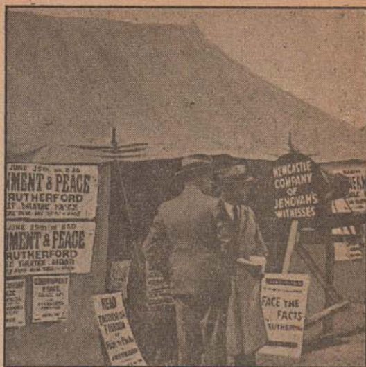
Tent at Newcastle-on-Tyne, England, used for advertising "Government and Peace"

"This is nasty business." What do you mean? The editorial with reference to Judge Rutherford and his associates is not based on facts. You say when people of this type are