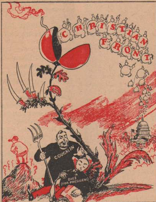
The Little Flower goes to seed