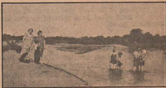
A California scene—Using the record on "Baptism"

◆ Word comes from Kansas that in one classroom the teacher is using Government and Peace as a textbook for the instruction of the children in the principles of true government.