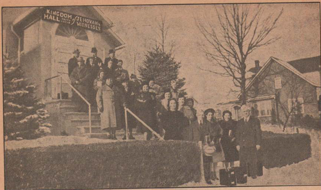
Kingdom hall and publishers, Roseto, Pa.

of Christ were not educated in any school, since at that time there were no schools, and consequently they wrote what they could under the circumstances.