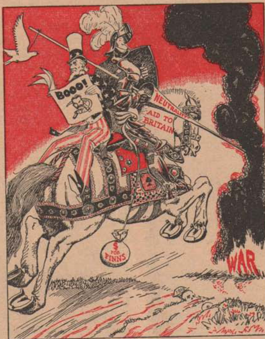
More "Peace in our Time"

The reality is that the War department has prepared a series of bills, comprising a general mobilization plan, to be submitted to Congress the moment war begins. Some time back the Senate munitions committee forced these bills into the open, over the protest of the War department. In their entirety they are sufficiently autocratic to suit the taste of any dictator. "They not only control all forms of business, but go so far as to control the services of every human being under the flag."—Portland Oregonian .