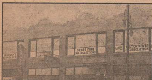
Kingdom hall, Toledo, Ohio