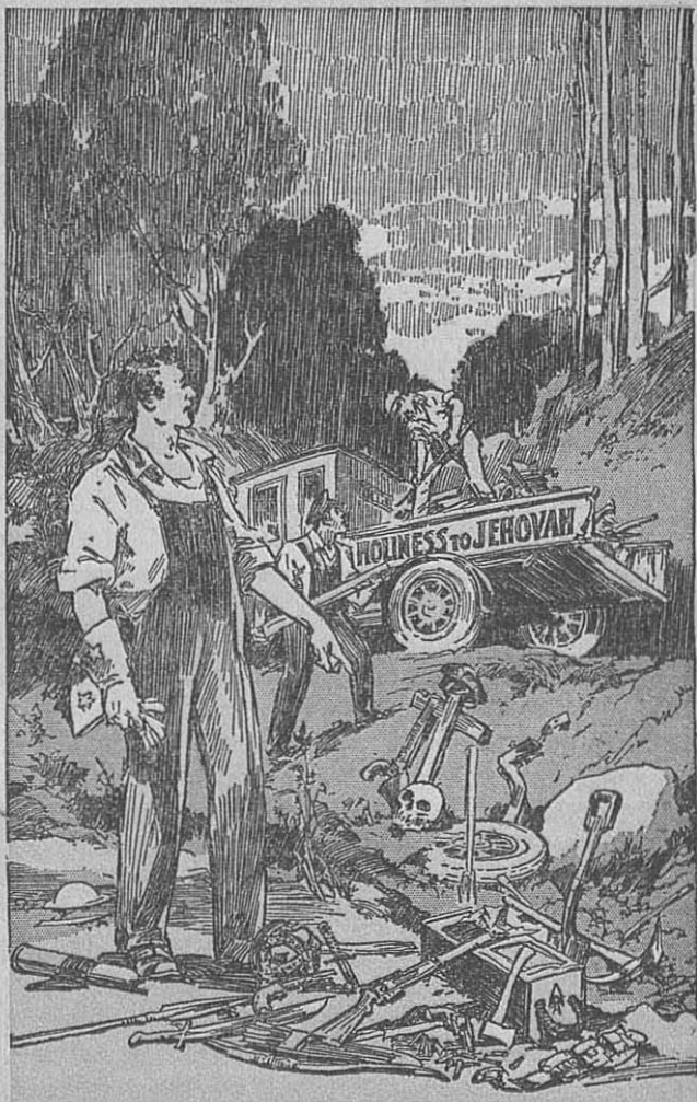
Cleaning Up Earth