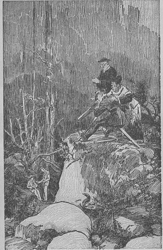
Walking Through the Valley of Death's Shadow Page 59

The psalmist then speaks of the house of Jehovah. The faithful ones now see that the house of Jehovah is his great organization of which Christ Jesus is the Head and King. In Psalm two it is stated that Jehovah has placed his beloved Son upon the throne and his rule has begun. The faithful see this and know that Christ has gathered unto himself those who serve God and that the work of vindicating Jehovah's name has begun. Also that in the ages to come those in the house of Jehovah will be for ever the recipients of his favor. Appreciating the love and mercy and the blessings of Jehovah