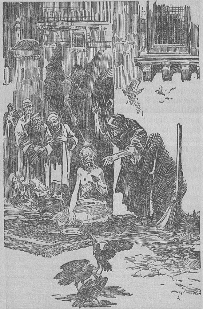
"Curse God, and die."

Jehovah permitted Satan to put Job to the test, and in so doing pictured how and why he