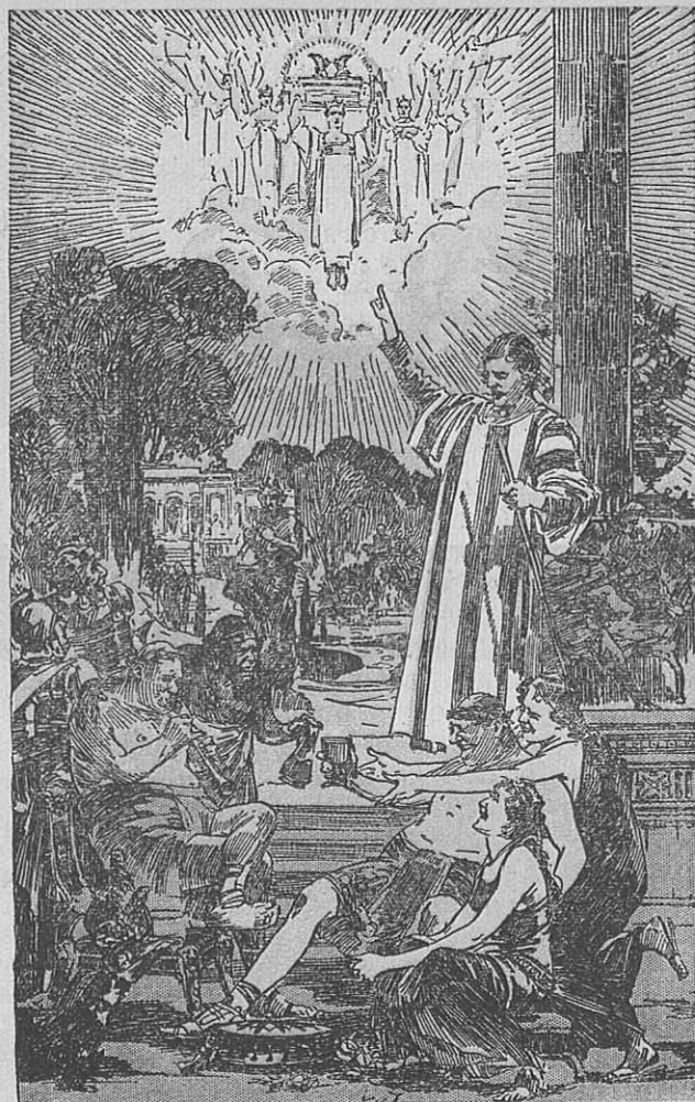
Enoch, the First Prophet