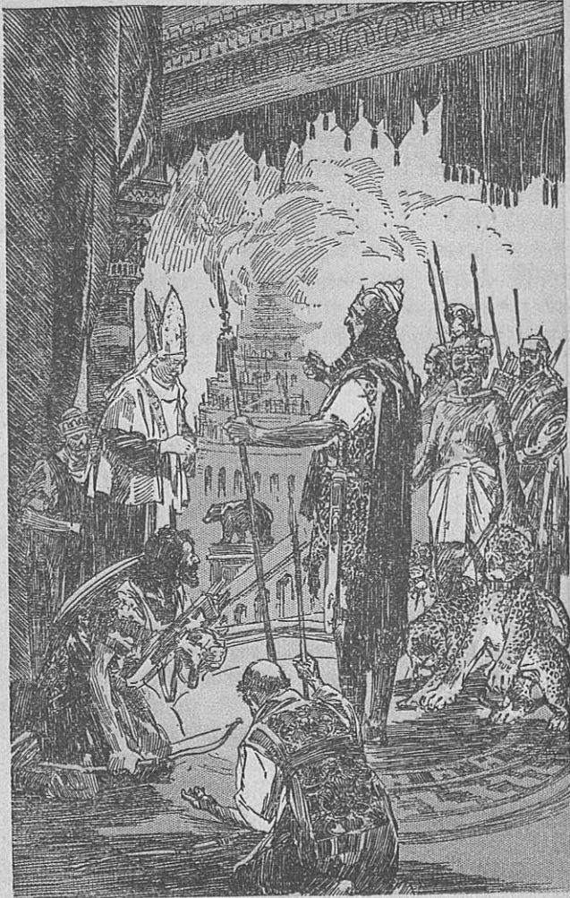
Practice of World Religion Begins

them and gave to them his law. His first great commandment to them is recorded in Exodus, the 20th chapter, and reads: "I am the Lord thy God, which have brought thee out of the land of Egypt, out of the house of bondage. Thou shalt have no other gods before me. Thou shalt not make unto thee any graven image, or any likeness of any thing that is in heaven above, or that is in the earth beneath, or that is in the water under the earth: thou shalt not bow down thyself to them, nor serve them."