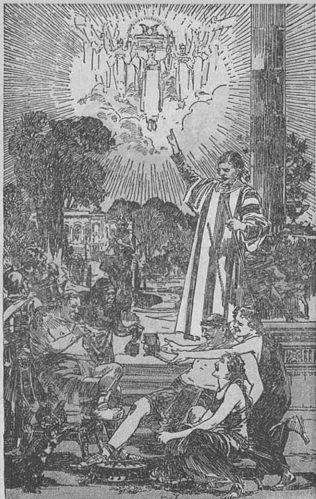
Enoch, the First Prophet