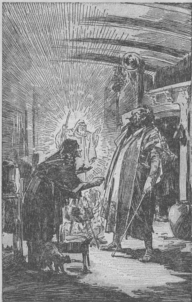
Saul and the Witch