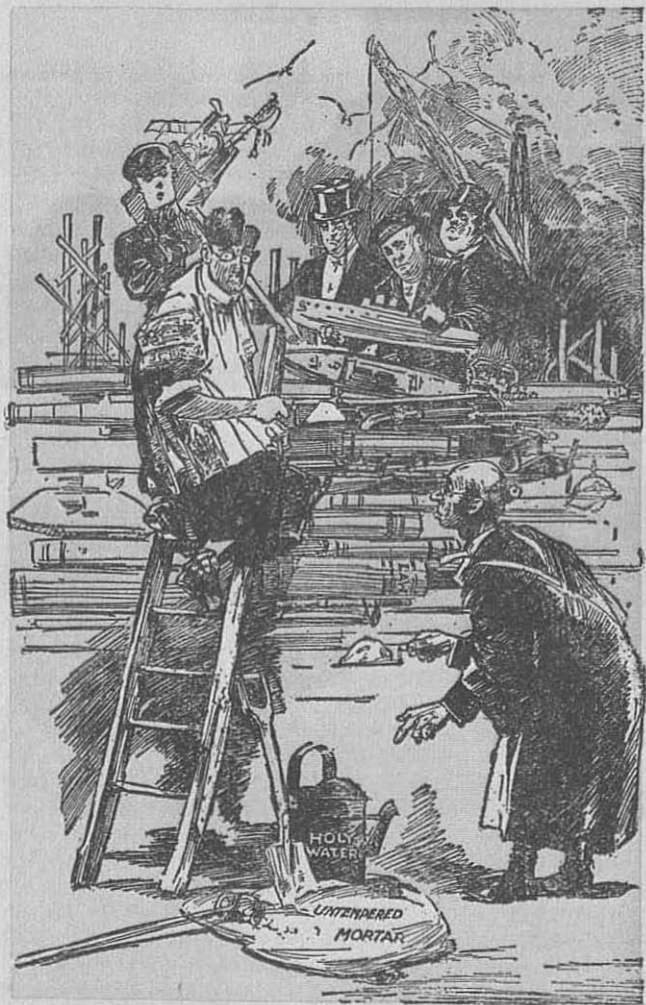
Building the breastworks