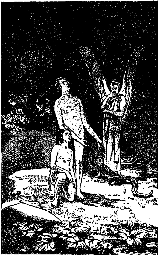
UNOINTED CHERUB—Commercial Iniquity Begins Page 95