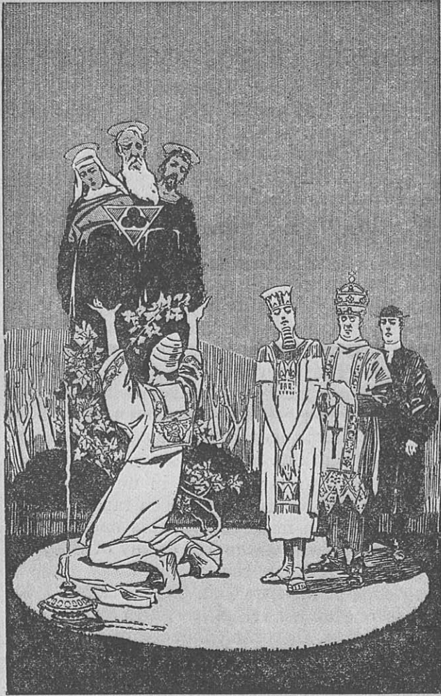
Worship of the trinity

tious men desired to appear wise and to thereby be able to hold control over the ignorant people, and hence they fell easy marks to the wiles of the Devil. The matter is summed up in Romans 1: 21-25, in these words: "When they knew God, they glorified him not as God, neither were thankful; but became vain in their imaginations, and their foolish heart was darkened: professing themselves to be wise, they became fools, . . . changed the truth of God into a lie, and worshipped and served the creature more than the Creator."