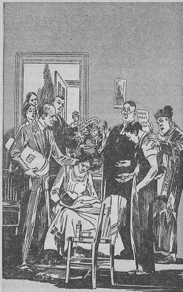
"Death is a friend" (?)—1 Cor. 15: 26

Addressing the clergy of his day Jesus said to them: 'Ye are of your father the Devil, because you make and practice lies.' Many theological schools and colleges today make and promulgate through their clergy the false doctrine of the evolution of man, which is a blasphemy of God's name and a contradiction of his Word. At the same time these men stand before the people, claiming to be God's representatives on earth. Take your own Bible now and read carefully the twenty-third chapter of Matthew, and